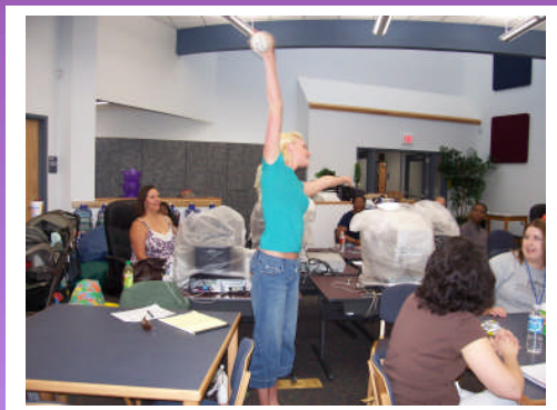
Nonlinguistic exercise on knowing your audience