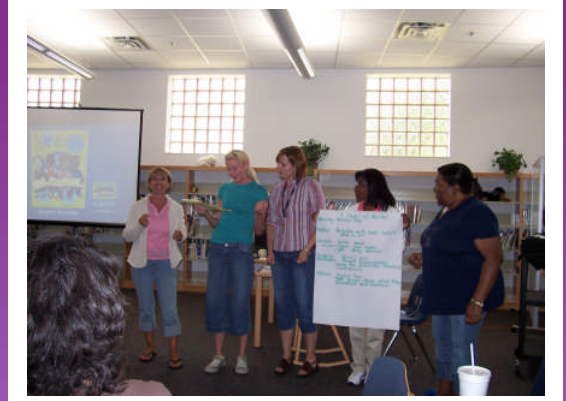
Teacher generated activities