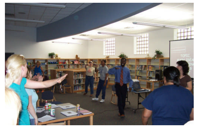
Main idea exercise